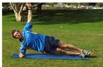
Side Bridge Leg Abductions